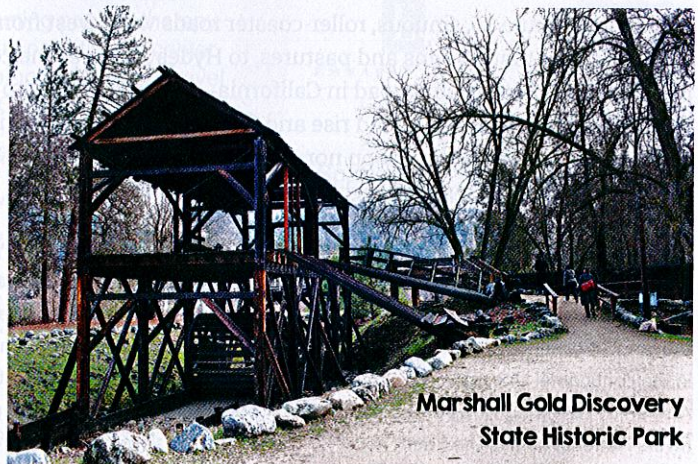
Marshall Gold Discovery State Historic Park