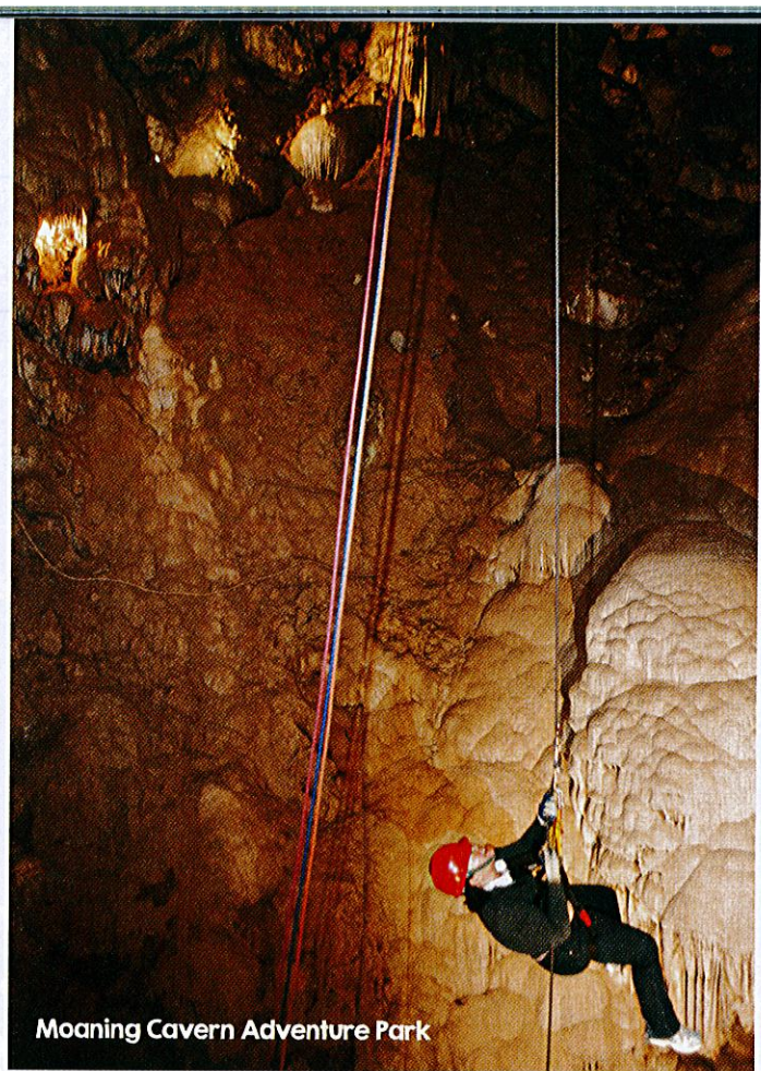
Moaning Cavern Adventure Park

Moaning Cavern Adventure Park, Vallecito. Hanging by the rope takes on new meaning for adventure-seekers rappelling 165 feet into Moaning Cavern, said to be the largest cave chamber in California. Those who prefer a more down-to-earth approach can descend a 100-foot steel spiral staircase to explore towering stalagmites, ancient stalactites, dramatic draperies, and mammoth flowstones. (209) 736-2708; caverntours.com/MoCavRt.htm .